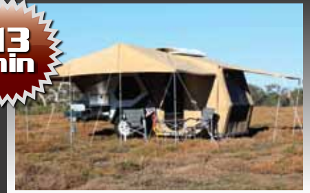
Main tent & awning roof