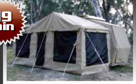
Main tent & awning walls