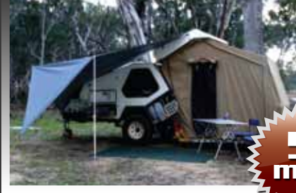
Main tent & Sail awning