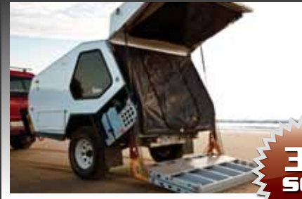
Rear insect screen