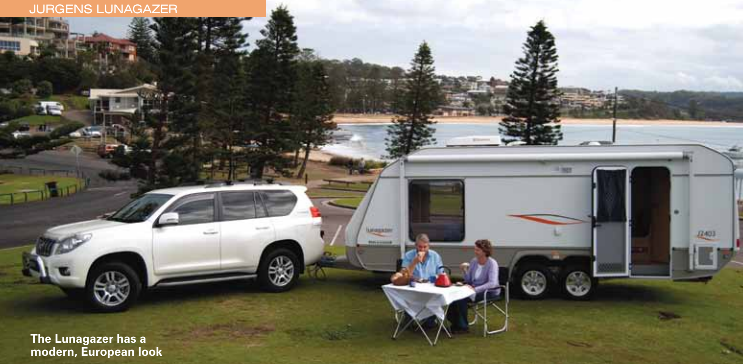
The Lunagazer has a modern, European look