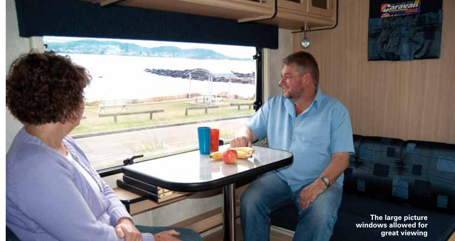
The large picture windows allowed for great viewing