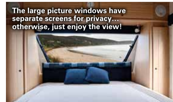
The large picture windows have separate screens for privacy... otherwise, just enjoy the view!