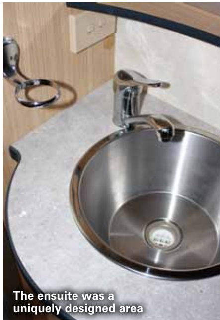
The ensuite was a uniquely designed area

The Jurgens Lunagazer comes at a competitive price, plus it's built to suit Australian conditions. The modern and fresh design of the Lunagazer should appeal to many buyers, and I am sure it will continue to be a very popular unit. ■