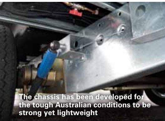
The chassis has been developed for the tough Australian conditions to be strong yet lightweight