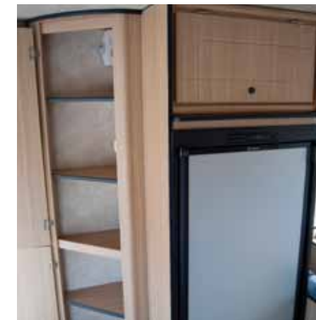
While the kitchen is not large it is certainly functional

Used in conjunction with the unique lightweight composite walls, the whole caravan weighs in at just 1680kg. This provides for a much larger caravan at a much lighter weight. More information